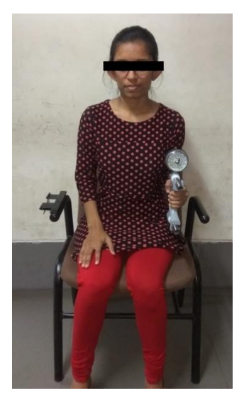
Fig. 3: Test position front view