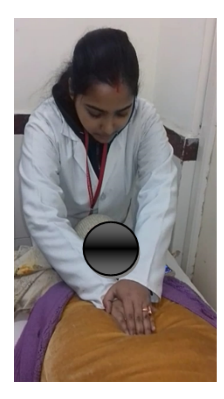
Fig. 4: Breathing in supine position, sternal pressure