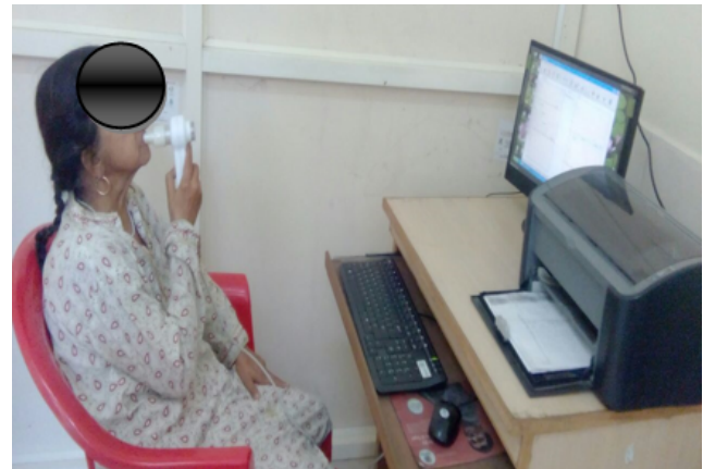
Fig. 3: PFT measurement

Chest wall expansion:Chest wall expansion measured at axillary level showed a significant improvement at pretest and post-test level in both conventional (p=0.03) and experimental (p=0.001) groups. The experimental group showed more improvement than the conventional group at post-test level (p=0.01). Expansion measured at the xiphisternal level also showed significant improvement in both the groups at pre-test and post-test level (p<0.05) as well as between groups (Table 5).