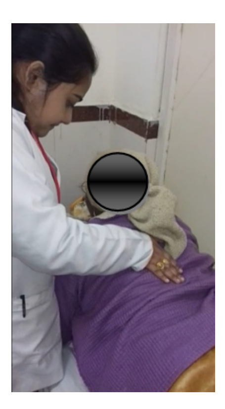
Fig. 7: Breathing in prone