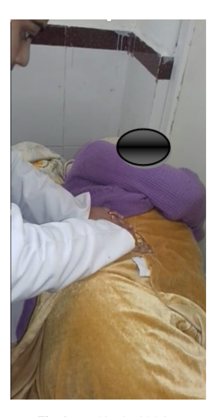
Fig. 6: Breathing in sidelying