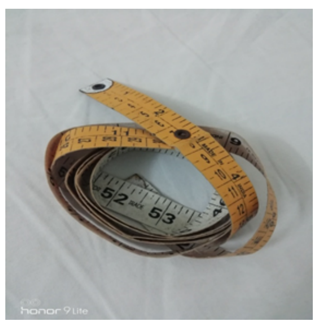
Fig. 2: Inchtape

FEV1/FVC: The ratio between FVC and FEV1 parameter failed to reach statistical significance levels in conventional (p=0.63) and experimental (p=0.73) group. There was also no significant difference exist between the groups at the post-test level (Table 4).